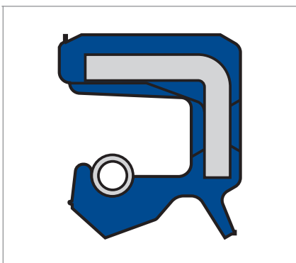
Simmerring BA ...SL